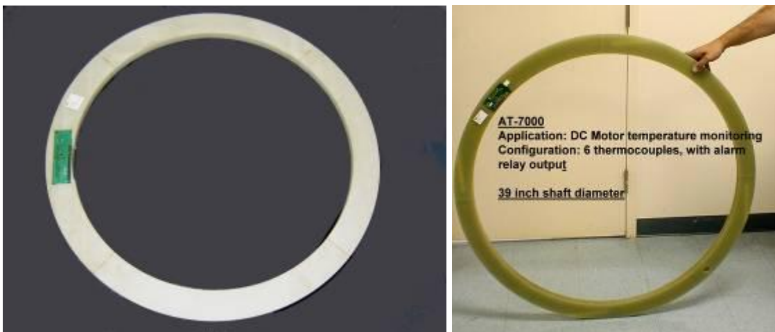
Transmitter telemetry collars for >30" rotor diameters of large motors