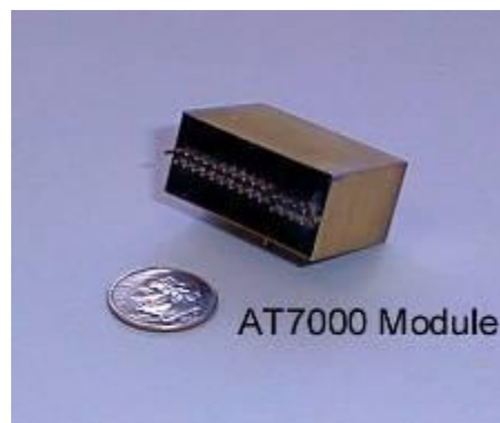
AT-7000 module (4 channels of RTD input, or 8 channels of thermocouple input)