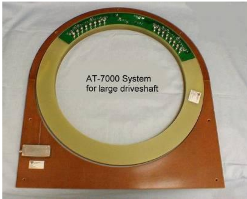
Stationary pickup/induction loop shown around a large transmitter collar